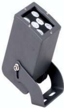
LED Shoot Light R2M2-TSD-D0602