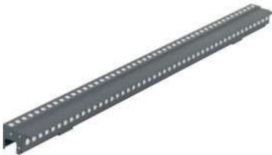
LED Linear Light R2M2-XTD-F48 R2M2-XTD-F48D