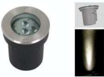
Adjustable LED Underground Light R2M2-DMD-A0301 R2M2-DMD-A0302