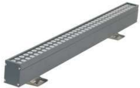
LED Wall Washer R2M2-XQD-H4801 R2M2-XQD-H7201