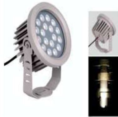
LED Flood Light R2M2-TGD-A1801 R2M2-TGD-A1802