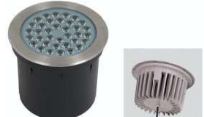
LED Underground Light R2M2-DMD-B3601 R2M2-DMD-B3602