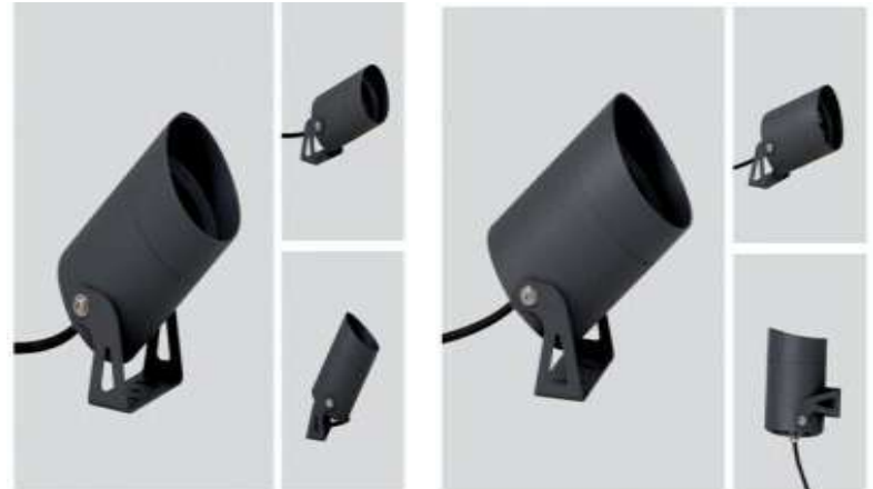
LED Shoot Light R2M2-TSD-C0301 R2M2-TSD-C0302