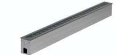
Linear LED Underground Light R2M2-DMD-D1801 R2M2-DMD-D2401 R2M2-DMD-D3601