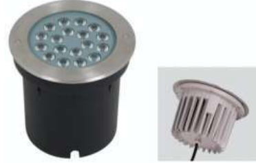
LED Underground Light R2M2-DMD-B1801 R2M2-DMD-B1802