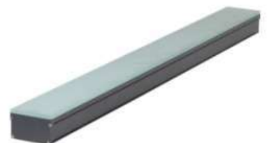
Linear LED Underground Light R2M2-DMD-F48