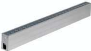
Linear LED Underground Light R2M2-DMD-C1801 R2M2-DMD-C2401 R2M2-DMD-C3601