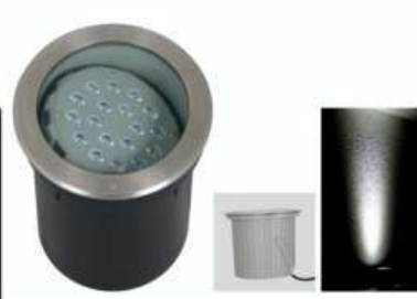
Adjustable LED Underground Light R2M2-DMD-A1801 R2M2-DMD-A1802