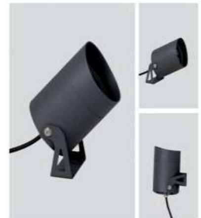
LED Shoot Light R2M2-TSD-C0601 R2M2-TSD-C0602