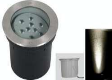
Adjustable LED Underground Light R2M2-DMD-A0901 R2M2-DMD-A0902 R2M2-DMD-A1201 R2M2-DMD-A1202