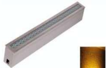
Linear LED Adjustable Underground Light R2M2-DMD-E1801 R2M2-DMD-E2401