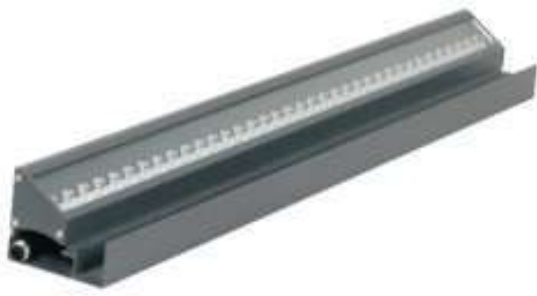
LED Wall Washer R2M2-XQD-G1801 R2M2-XQD-G2401 R2M2-XQD-G3601