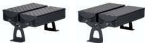
LED Flood Light R2M2-TGD-F7202 R2M2-TGD-F10802 R2M2-TGD-F14402