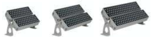
LED Flood Light R2M2-TGD-E7201 R2M2-TGD-E14401