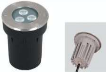
LED Underground Light R2M2-DMD-B0301 R2M2-DMD-B0302