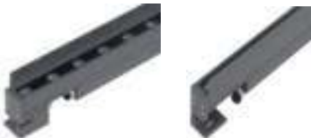
LED Wall Washer R2M2-XQD-D1801 R2M2-XQD-D2401