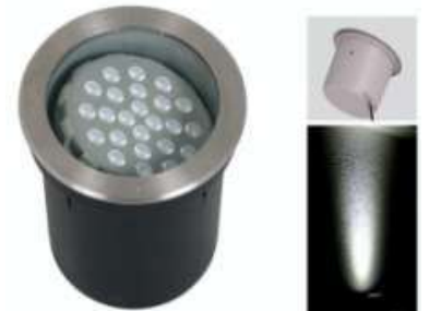
Adjustable LED Underground Light R2M2-DMD-A2401 R2M2-DMD-A2402