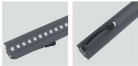
LED Linear Light R2M2-XTD-D48 R2M2-XTD-D48D