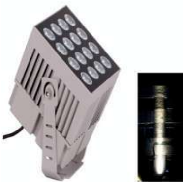
LED Flood Light R2M2-TGD-B0506 R2M2-TGD-B0906 R2M2-TGD-B1606