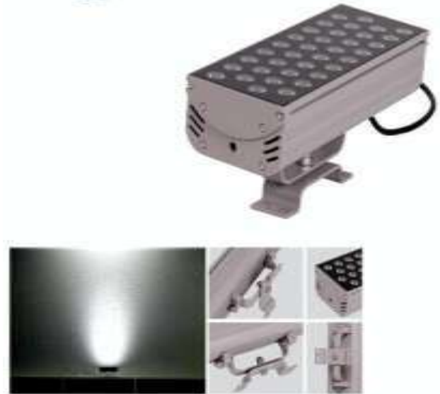
LED Flood Light R2M2-TGD-C3601 R2M2-TGD-7201