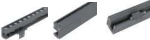
LED Wall Washer R2M2-XQD-A1801 R2M2-XQD-A2401 R2M2-XQD-A3601