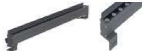
LED Wall Washer R2M2-XQD-F1801 R2M2-XQD-F2401 R2M2-XQD-F3601