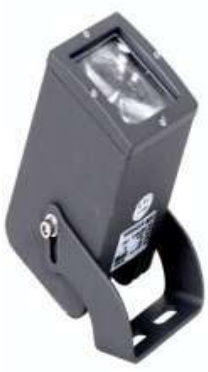
LED Shoot Light R2M2-TSD-D0110