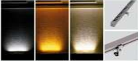
LED Linear Light R2M2-XTD-A48