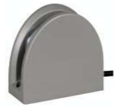
LED Windowsill Light R2M2-TSD-E0601 R2M2-TSD-E0601D