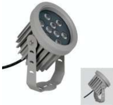
LED Flood Light R2M2-TGD-A0901 R2M2-TGD-A0902 R2M2-TGD-A1201