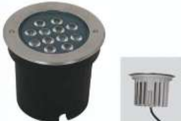
LED Underground Light R2M2-DMD-B0901 R2M2-DMD-B0902 R2M2-DMD-B1201