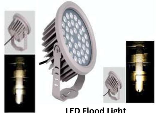
LED Flood Light R2M2-TGD-A3601 R2M2-TGD-A3602