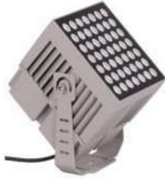
LED Flood Light R2M2-TGD-B1502 R2M2-TGD-B2502 R2M2-TGD-B4902