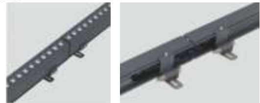
LED Linear Light R2M2-XTD-E48 R2M2-XTD-E48D