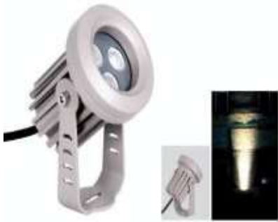
LED Flood Light R2M2-TGD-A0301 R2M2-TGD-A0303