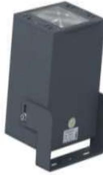
LED Shoot Light R2M2-TSD-D0130